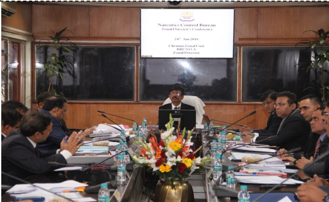
Zonal Directors' Meeting held on 24.01.2018 at NCB Headquarters, New Delhi