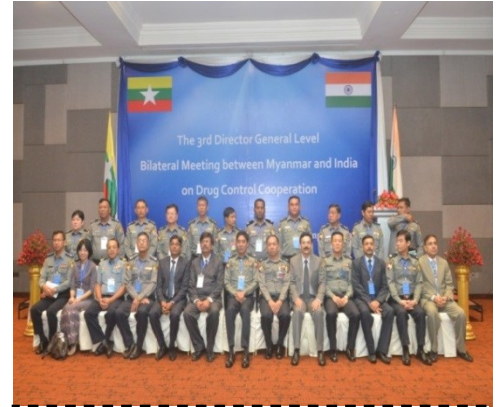
3 rd DG Level Bilateral Meeting between NCB, India & CCDAC Myanmar held on 23.02.2018 at Yangon Myanmar