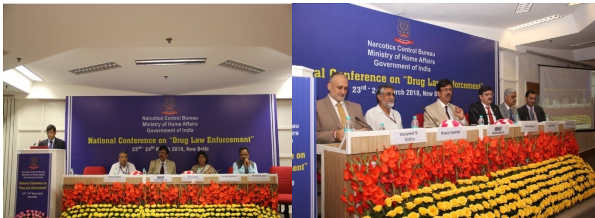
Presentations by State/Central Agencies on regional issues.