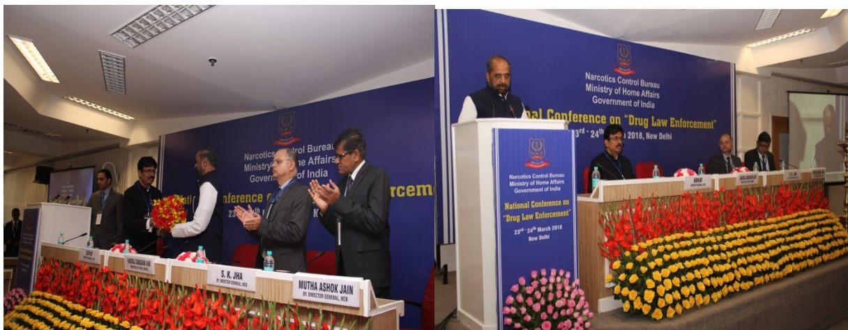
Opening address by Hon'ble MoS Shri Hansraj Gangaram Ahir