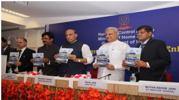
Release of Annual Report, 2017 by Hon'ble Home Minister, Shri Rajnath Singh

drug law enforcement on a common platform and to discuss the issues related to drug trafficking like trends in drug seizures, investigation techniques, best practices, recent developments, challenges etc.