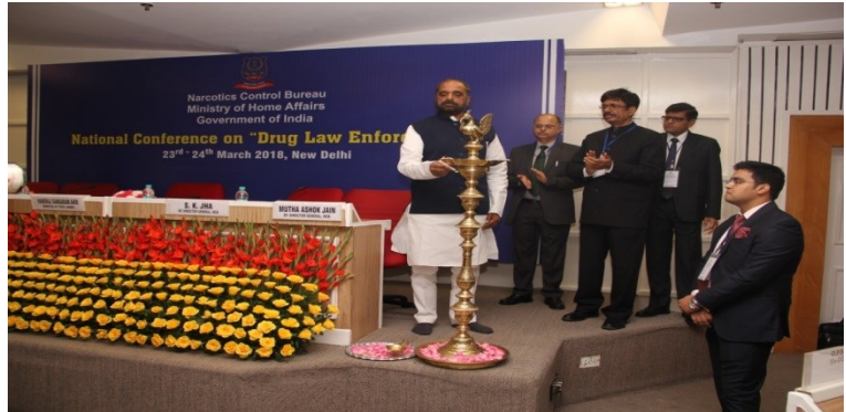
Inauguration of National Conference, 2018 by Hon'ble MoS Shri Hansraj Gangaram Ahir

Narcotics Control Bureau, being the National nodal agency for Drug Law Enforcement in India organized a two days' "National Conference on Drug Law Enforcement" on 23 rd & 24 th March, 2018. The purpose of the conference was to bring all the agencies working in the field of