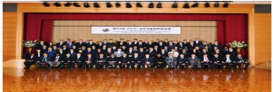
23 rd Asia-Pacific Operational Drug Enforcement Conference (ADEC-23), Tokyo, Japan from 05 th to 09 th February 2018.