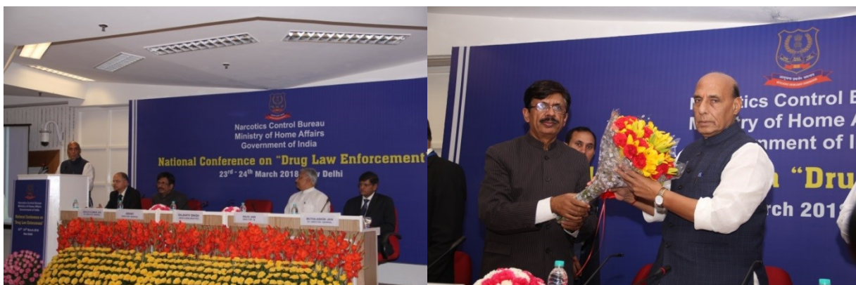
The valedictory speech by Hon'ble Home Minister, Shri Rajnath Singh.