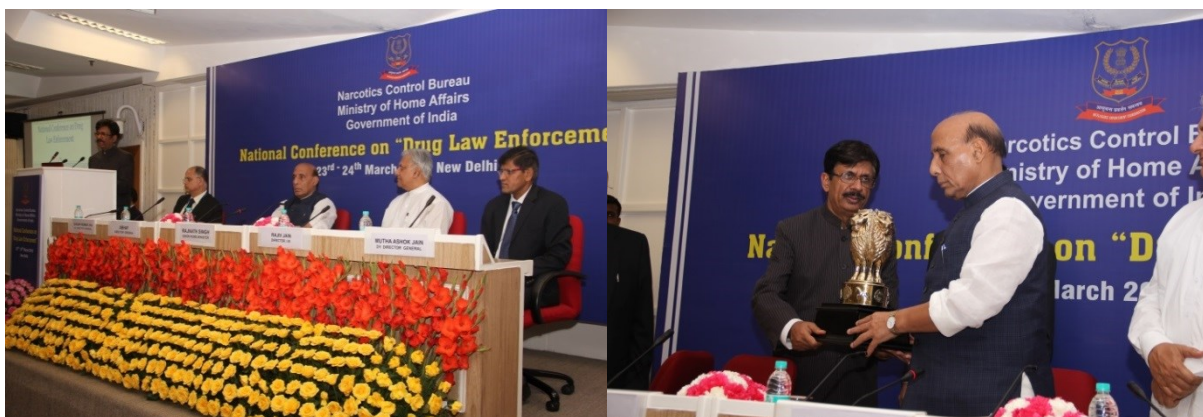
Closing ceremony & felicitation to Hon'ble Home Minister, Shri Rajnath Singh.