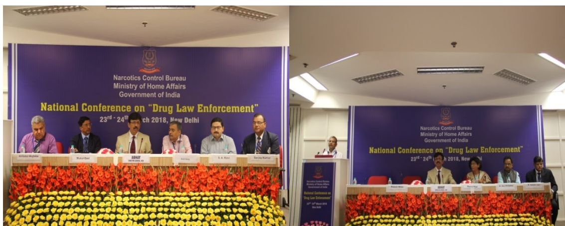
Presentation of specialized speakers