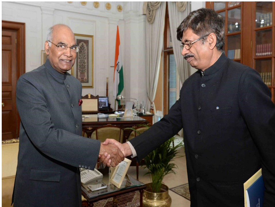
DG, NCB Shri Abhay meeting with Hon'ble President of India, Shri Ramnath Kovind