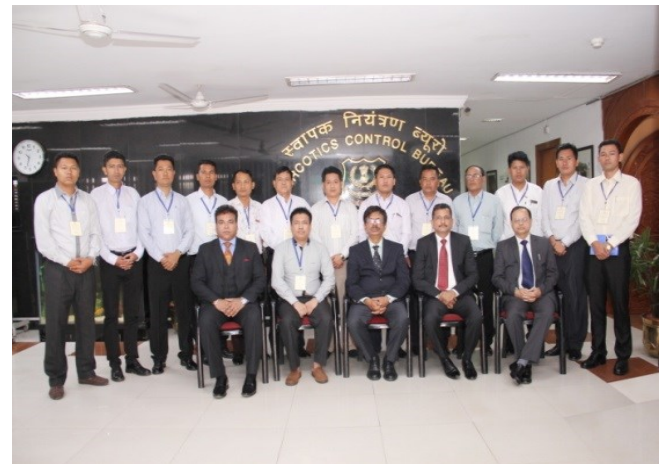
Photos of Training Programme for officers of Myanmar Drug Law Enforcement Agency conducted from 19 February, 2018 to 23 February, 2018 at NCB Hqrs, New Delhi, India.