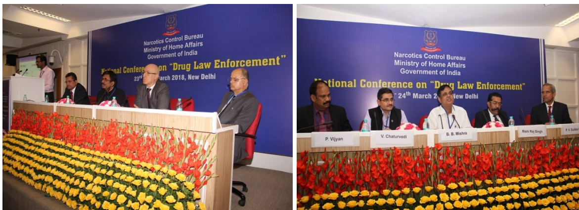
Panel discussion on wider context of drug trafficking in India.