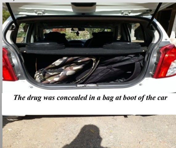
Seizure of 14.16 Kg of Hashish by Ahmedabad Zonal Unit