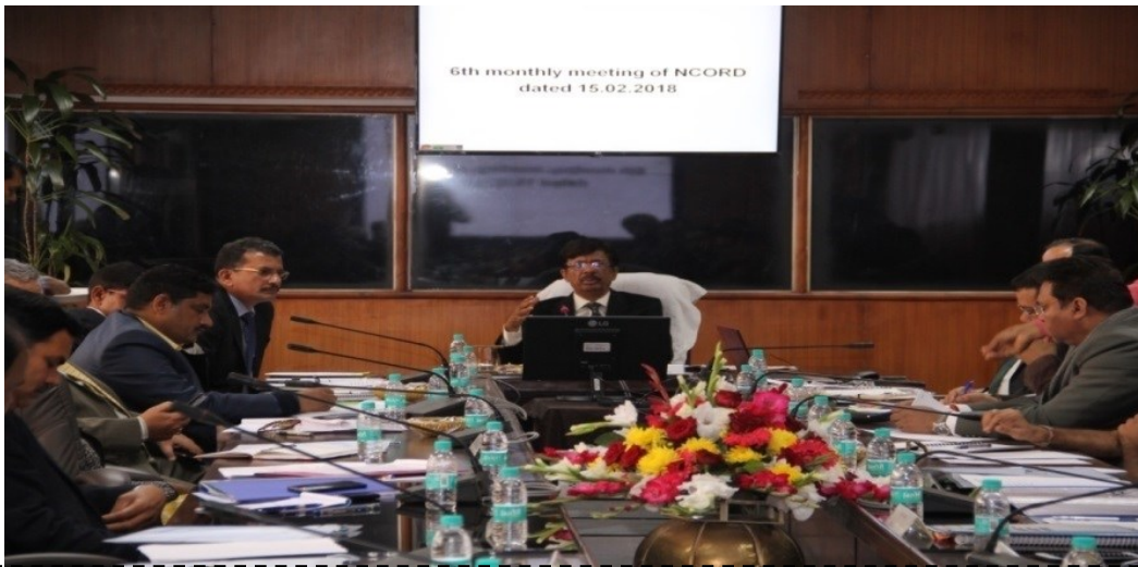
Sixth Monthly meeting of NCORD on 15.02.2018 at NCB Headquarters, New Delhi